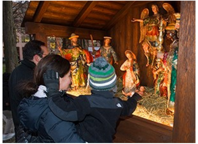
Keep Christ in Christmas